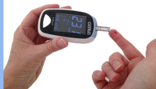
Measurement & beeping for measurement data