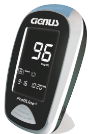
ProfiLine BLE TeleMed